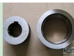
cone/cake output ring