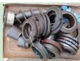
spare parts set