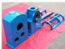
gearbox/ cage bar