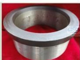
cake output ring